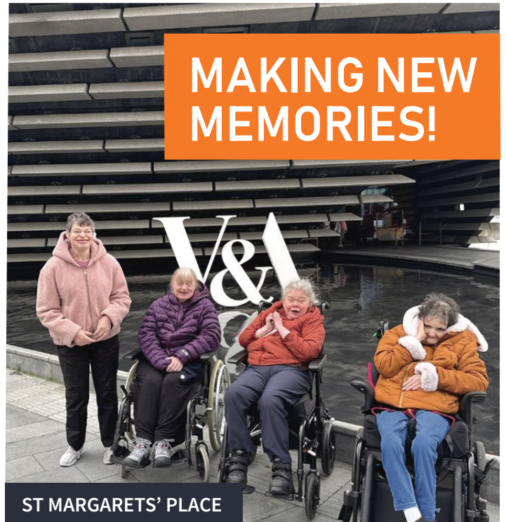
ST MARGARETS' PLACE

The ladies had a very busy and enjoyable Christmas period, taking part in multiple parties, social gatherings, and outings, which everyone really looked forward to.