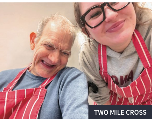
TWO MILE CROSS

We are looking forward to warmer weather and longer days so we can get out and about even more.